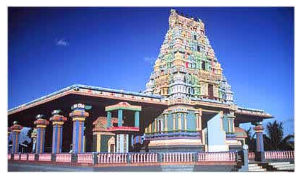
Periya Kovil: Śrī Siva Subramaniya Temple - Nadi, Fiji