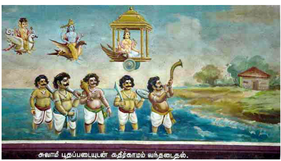
Lord Murugan and His entourage land in Lanka at Katirkamam after crossing the ocean. Temple painting from Śrī Subramanya Swami Devasthanam Kumāra Vayalur

Yet, with the exception of Lanka where Tamil community took root long ago and has remained ever since, it was only with the rise of international trade in the 18th and 19th centuries that Tamils in search of a better economic opportunities ventured to cross the Indian Ocean and settle in far-off lands such as Africa, Mauritius, Seychelles and Reunion Island to the west, or Burma, Malaya, Singapore, Australia and even Fiji to the east. Most were simple rural folk, often landless, who signed on as indentured labourers on the great rubber, coconut and sugar estates that were the mainstay of early colonial economies in the region. Others of the Chettiar community set out in search of opportunities in the field of trade and commerce. Still others were recruited from India and Sri Lanka for their expertise as administrators.