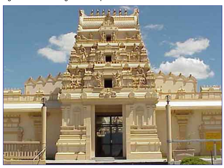
Sydney Murukan Temple gopuram and entrance See "Murukan worship in Australia" by Dr Arumugam Kandiah .

The Second International Murugan Conference, hosted by the island nation of Mauritius, is a fitting tribute not only to the Tamils of Mauritius who have resolutely answered the call of the heart during long decades of separation from Mother India, but to the entire Tamil diaspora throughout the Indian Ocean region and beyond. Quietly and with little fanfare, they have held aloft the flame of devotion not only to their beloved deity Lord Murugan and His traditions, but also kindled within themselves and others a passion for Tamil language, religion and culture in all its myriad aspects and dimensions. Thereby they have not only honored their ancestral traditions and redeemed themselves as authentic Tamil Hindus, but they have also made it possible for the light of ancient wisdom traditions to shine for future generations as well.