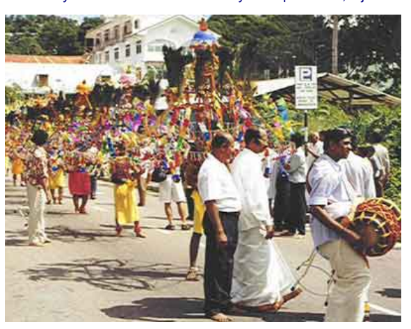
Annual Kavadi procession through Victoria, capital of Seychelles